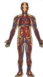
Your Circulatory System

In science, we will be looking at animals including humans with a focus around the circulatory system.