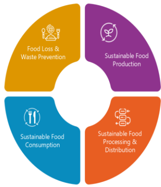
Farm To Fork

In Design and Technology , the children will be learning about food from farm to fork . They will explore where our food comes from, how it is produced and processed, and the journey it takes before reaching our plates. The children will also consider nutritional choices , learning about balanced diets and how to make healthy food decisions. Through this, they will develop a greater understanding of food preparation, sustainability and healthy living.